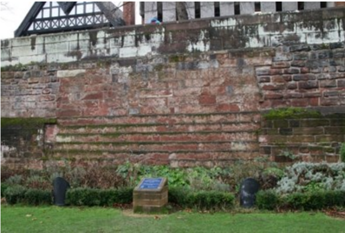
Repaired Civil War breach in the Walls

Since then the walls have not been needed to defend Chester and have become a pleasant walkway around the city.