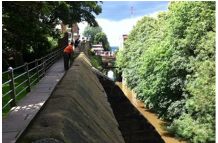
Restored Roman wall near Northgate